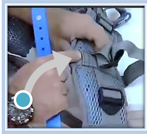
Locate the lower mounting pocket