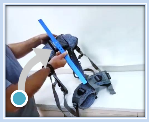
Adjust the length of the bar Using the screws.