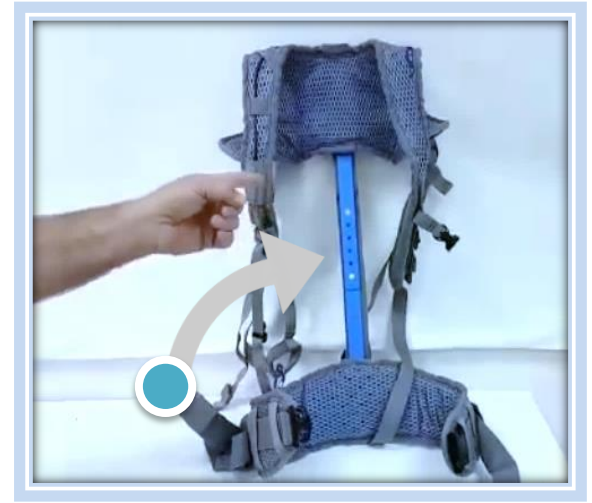
You are ready to go.... Enjoy!