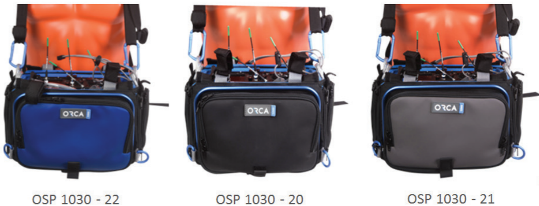
OSP 1030 - 22 OSP 1030 - 20 OSP 1030 - 21