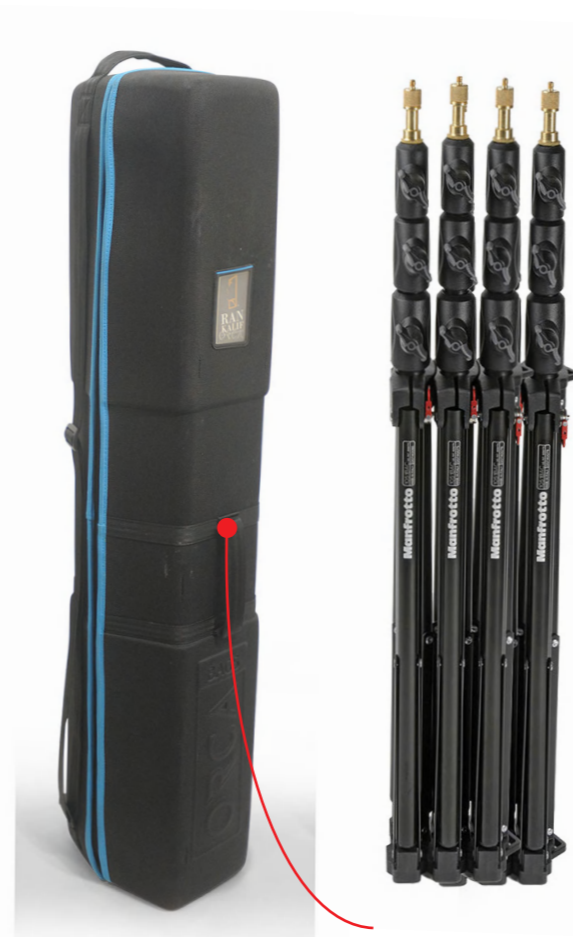
4 stackable stand configuration Shown with Manfrotto Photo Master Stand1004BAC