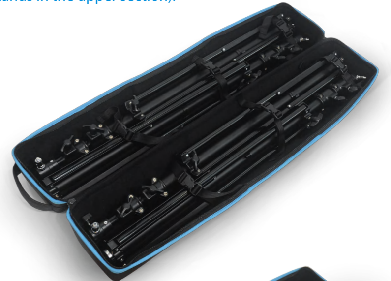
Full size tripod CONFIGURATION

Optimized to hold multiple light stands, a large tripod with a head, or a split-load (e.g., a lighting kit in the lower section and stands in the upper section).